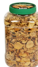
PET jar of 600g CATERING SIZE