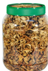
PET jar of 350g