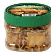
PET jar of 60g