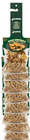
7-pack of PP bags