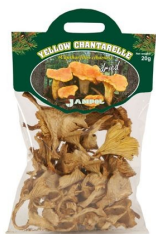
PP bags of 20g and 40g