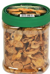
PET jar of 150g