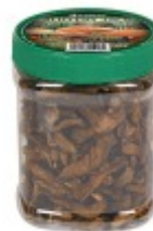
PET jar of 150 g / 5.29 oz