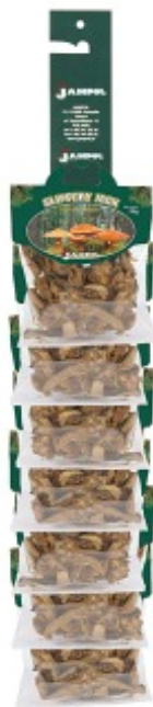
7-pack of PP bags