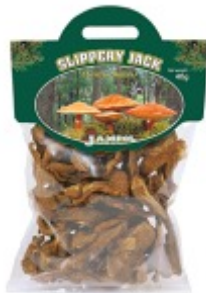
PP bag of 40 g / 1.41 oz