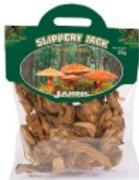
PP bag of 20 g / 0.71 oz