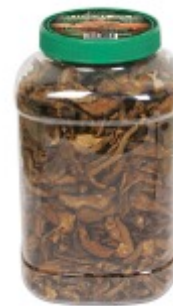
PET jar of 600 g / 21.16 oz CATERING SIZE