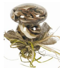
Glass jar of 50g