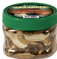
PET jar of 50g