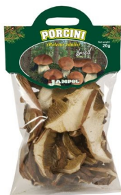
PP bags of 20g and 40g