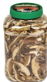
PET jar of 500g CATERING SIZE