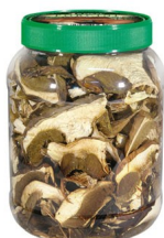
PET jar of 250g