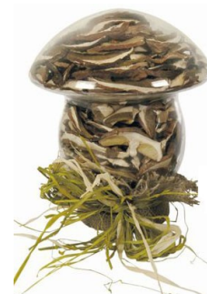
Glass jar of 250g