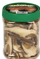
PET jar of 100g