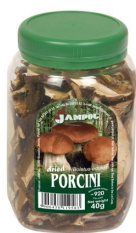
PET jar of 40g