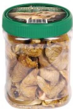
PET jar of 80 g / 2.82 oz