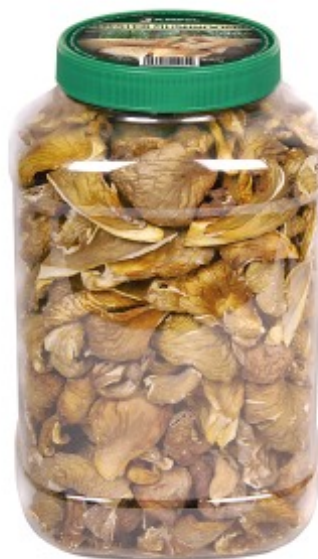
PET jar of 400 g / 14.11 oz CATERING SIZE