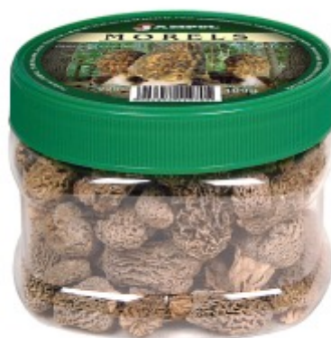
PET jar of 100 g / 3.53 oz