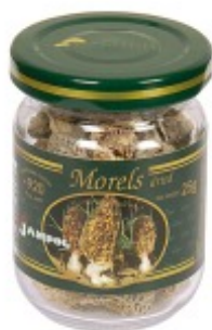
Glass jar of 25 g / 0.88 oz