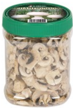
PET jar of 80 g / 2.82 oz