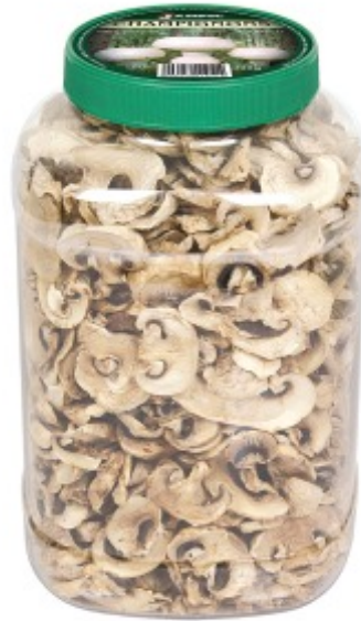
PET jar of 300 g / 10.58 oz CATERING SIZE