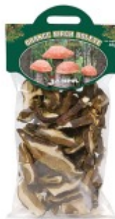
PP bag of 40 g / 1.41 oz