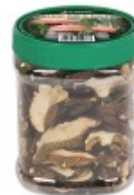
PET jar of 100 g / 3.53 oz