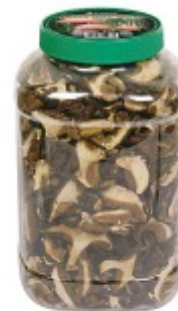
PET jar of 500 g / 17.64 oz CATERING SIZE