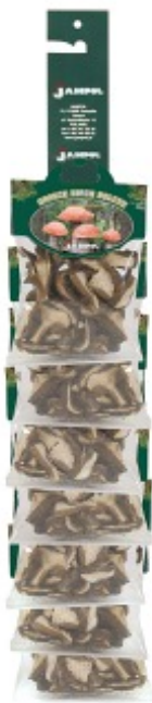
7-pack of PP bags