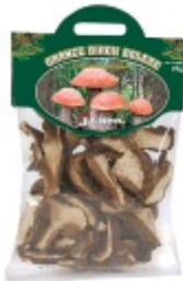
PP bag of 20 g / 0.71 oz