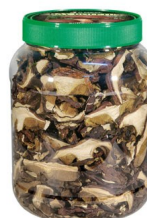
PET jar of 250g