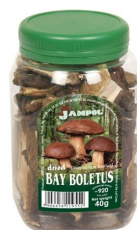
PET jar of 40g