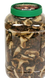
PET jar of 500g CATERING SIZE