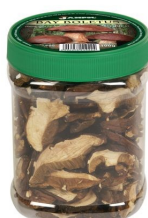
PET jar 100g