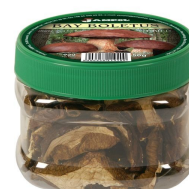
PET jar of 50g