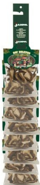
7-pack of PP bags