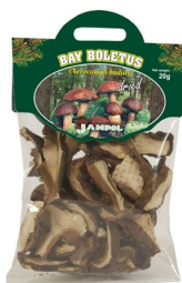
PP bags of 20g and 40g